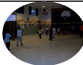
The crew enjoying a game of volleyball during enrichment.