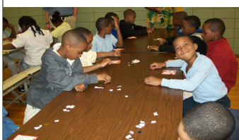
Left: Students playing a game of bingo.