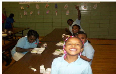
Above: Students enjoying their meal during dinner time.